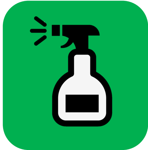
Cleaning, Disinfecting, Sanitizing