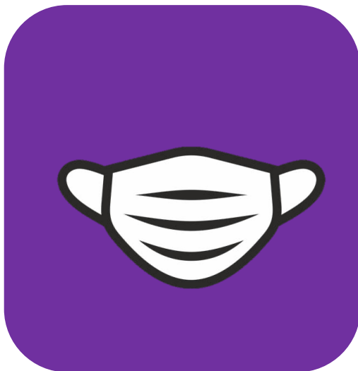
Personal Protective Equipment